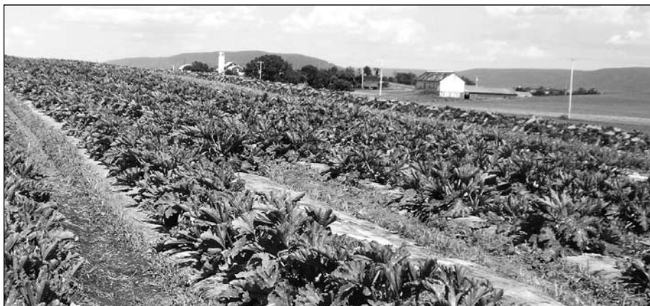
AEA's system combines advanced drip irrigation, foliar feeding, bio-fortification of soil with microbes, micronized inputs and more to provide optimal nutrition for crops.