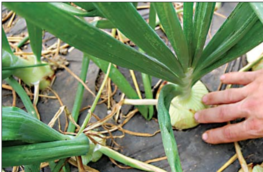
The AEA systems approach to plant nutrition results in hardy, nutrition-packed foods, such as this lush onion crop.

All this activity stimulates the growth of mycorrhizal fungi, which release phosphorus that had been tied up in the organic matter and soil. Mycorrhizae also add organic matter (which is converted